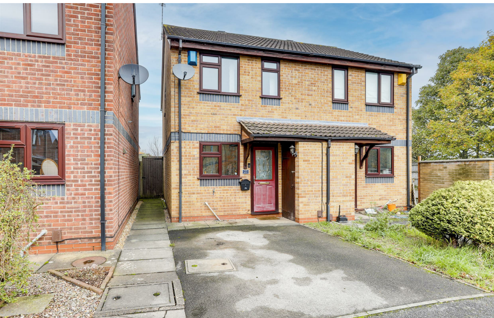
Roseberry Gardens, Hucknall, Nottinghamshire NG15 7PX